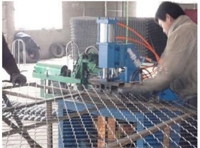
Diamond Mesh Crimping Machine02