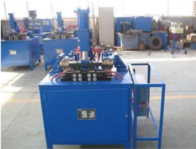
Diamond Mesh Crimping Machine01

3. Small Power which can save energy, lower cost, simple structure, sturdiness and durability, smooth operation without noise as well as safety using.