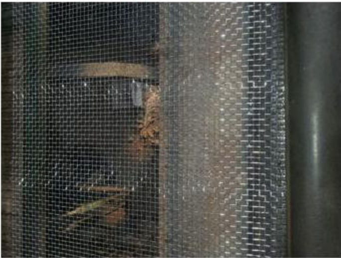
(Once-through)Series Crimped Wire Mesh Weaving Machine04