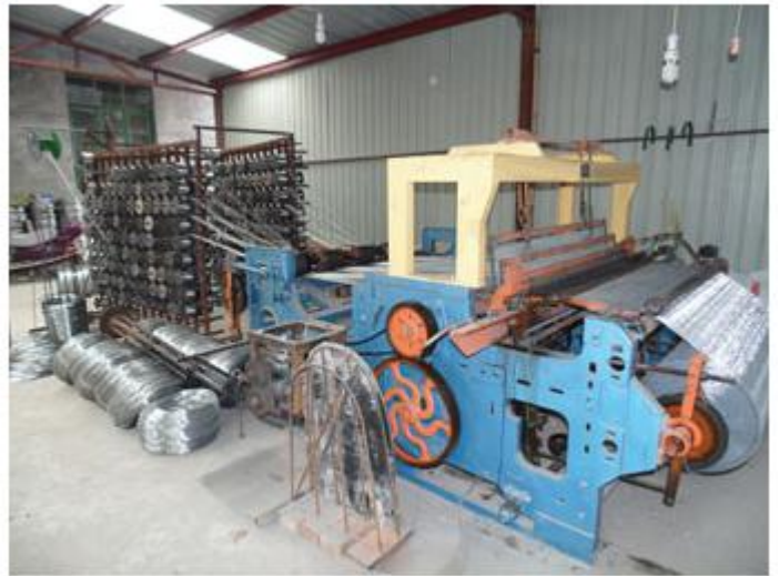
(Once-through)Series Crimped Wire Mesh Weaving Machine05