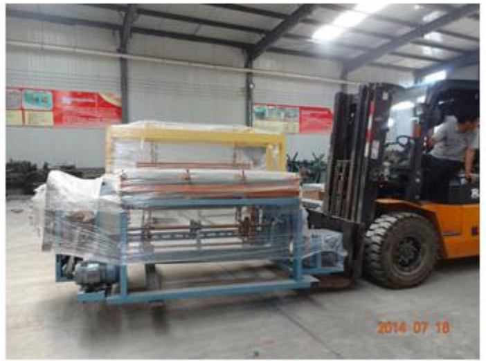
(Once-through)Series Crimped Wire Mesh Weaving Machine02